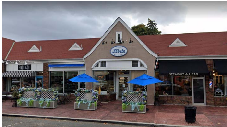
L'Arte Google Maps

< VERY HOT & HUMID, A FEW LATE T-STORMS >